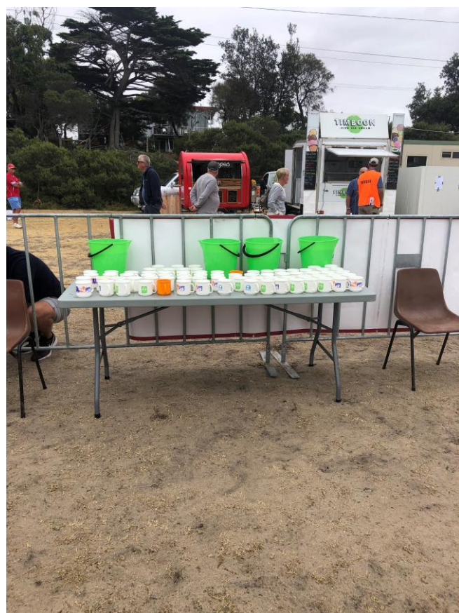
Above: Reusable mugs greeted the swimmers after exiting the swim